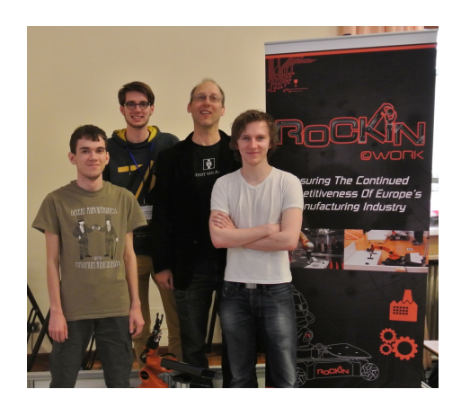
Figure 5: Image captured with a Ricoh Theta from the KUKA youBot.

problems, but how to structure the solution in the most effective and elegant manner. Therefore he has taken the role of software architect upon him, investigating and realizing a dedicated framework for the team to use.