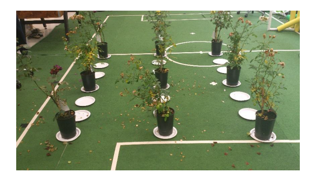
Figure 2: The setup used for the project 'Navigating youBot through a rose field with A*'.

As the accessible terrain may change when plants are removed, added or relocated, an internal map representation must dynamically be updated when the robots moves. Because the location of the desired plant is not (exactly) known at the start of the search, some kind of greedy mapping could be used. As soon as the plant is found and picked up though, pathplanning can be used to calculate the most efficient way back to the robot's initial position (and thus the customer). As still the map may have changed during the pickup, even the pathplanning should be dynamical as well. In order to implement this, a first version of D*-Lite [3] was developed and tested. As for now, it is assumed that the configuration of the setup does not change so that path planning can be carried out by basic A* (illustrated in Fig. 2). The full details of this approach can be read in the project report [2].