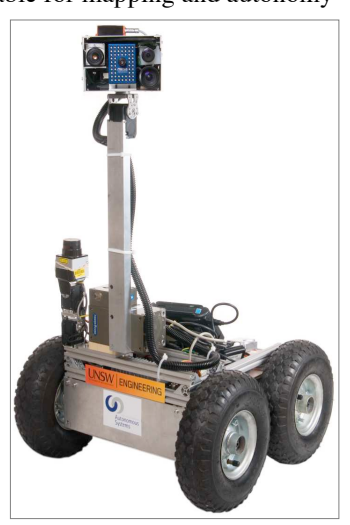
Fig. 2 Emu with sensors

2. Emu: A 4 wheeled robot base that has less mobility than the Negotiator but is more stable for mapping and autonomy