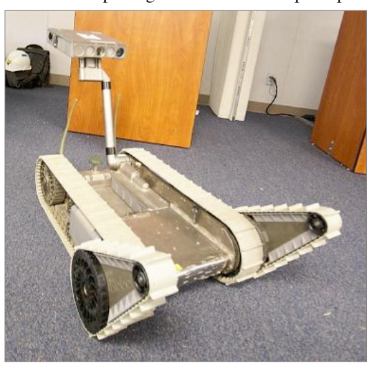
Fig. 3 PackBot

3. Packbot: An iRobot PackBot Explorer has been equipped with an additional sensor head package and external computer power.