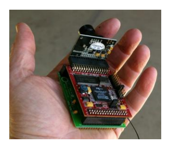
Fig. 3. Surveyor SRV-1 Blackfin controller with OmniVision OV7725 camera.

Teleoperative navigation is managed through visual data streamed through the OmniVision OV7725 camera and our LabVIEW vision interface. From the camera we can get edge, horizon and obstacle detection data as well as images.