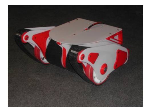
Fig. 7. RKRS Mobility base.

loose belt fit and we experienced jamming of our belts tooth on tooth at the drive wheels effectively stalling the robot. The timing belts also placed a significant load on the motors causing them to pull high current (16A per motor) and trigger the protection circuitry within the motors completely stalling the robot. High current draw also reduced our overall runtime. With the change over to the Intralox chain-belt we retain positive drive (no slippage), we can run our belts loose as the chain-belt is driven by a sprocket system that guides sprocket teeth into the chain drive, and the flexibility of the Intralox components has dropped our current draw to roughly 3A per motor. The Intralox components have also dropped the overall cost of the robot significantly.