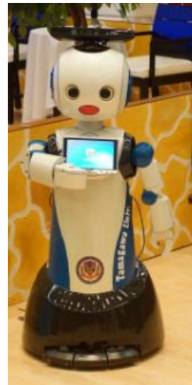
Fig. 4. tama@home