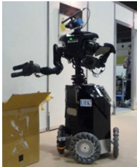
Fig. 3. DiGORO