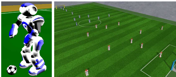
Figure 1. On the left is a screenshot of the Nao agent, and on the right a view of the soccer field during a 11 versus 11 game.