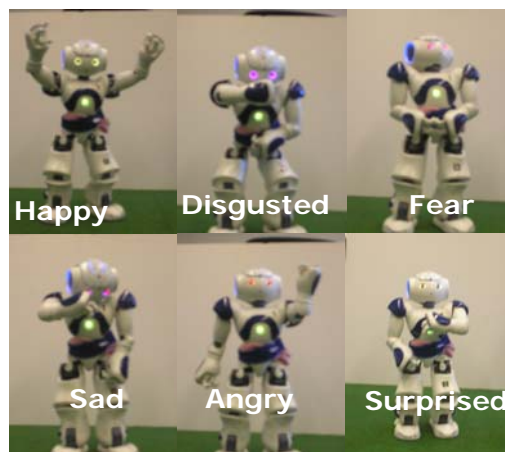
Figure 1. The basic emotions [3] expressed by the Nao robot.

The Nao is a humanoid robot 1 whose internal functions are accessible by multiple programming languages. The Python interface was selected, which gives remote access to all methods from the native Naoqi library (version 1.6.13). In this study the standard Naoqi library is extended with an experimental library of emotional expressions, kindly provided by the developers of Aldebaran [2]. The Nao robot has limited expression in its face, so the emotions are mainly expressed by body language. The emotional expression library provides a variety of animations, but doesn't provide the logic when to activate the emotions.