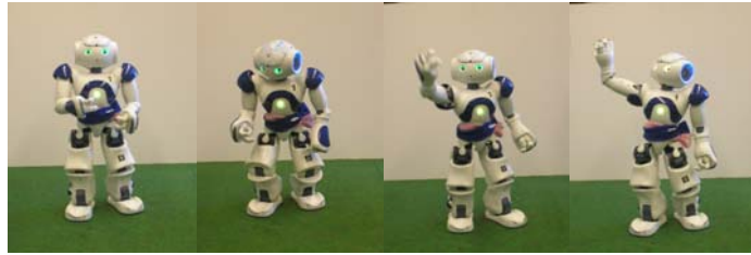
Figure 3. Sequence of animations with increasing valence (aBitHappy → veryHappy).

In Figure 4 the locations in the affective space are given for the 9 selected emotional expressions.