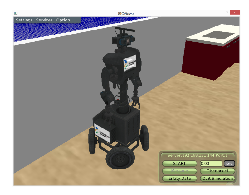
Figure 3: Simulated robot used in RoboCup@Home simulation 2014