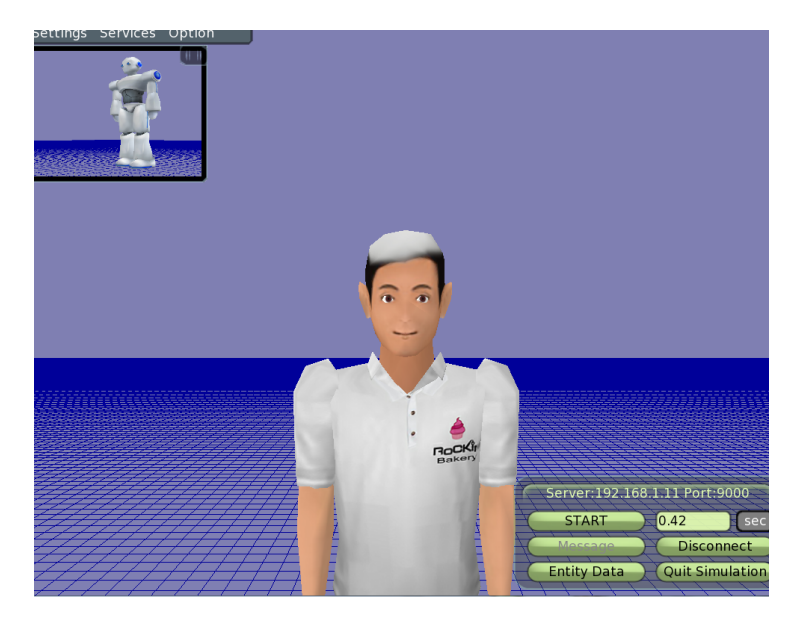
Figure 4: Deli man represented in SIGVerse

Other than the gathering of required training data, the testing data present an additional complication. When gathering testing data, images will be made of the simulated avatar of a person in SIGVerse. This avatar represents either a recognizable person or a stranger. The performance of the recognizing algorithm however, depends on the level of detail in which the appearance of the avatar is depicted.