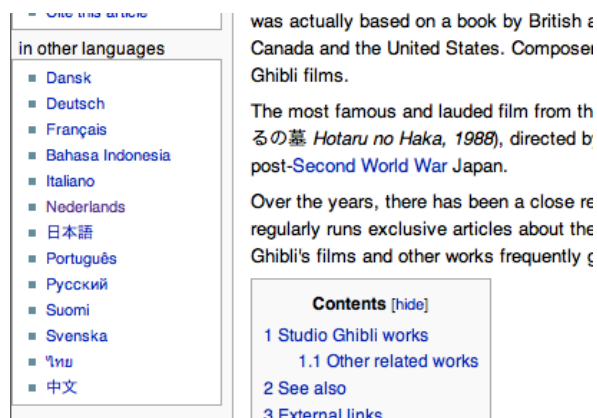
Figure 2: Links to pages devoted to the same topic in other languages.

concepts or entities that have entries in Wikipedia, and we will represent sentences by entries from this lexicon: an entry is used to represent the content of a sentence if the sentence contains a hypertext link to the Wikipedia page for that entry. Sentence similarity is then captured in terms of the shared lexicon entries they share. In other words, the similarity measure that we use in this approach is based on “concept” or “page title” overlap. Intuitively, this approach has the advantage of producing a brief but highly accurate representation of sentences, more accurate, we assume than the MT approach as the titles carry important semantic information; it will also be more accurate than the MT approach because the translations of the titles are done manually.