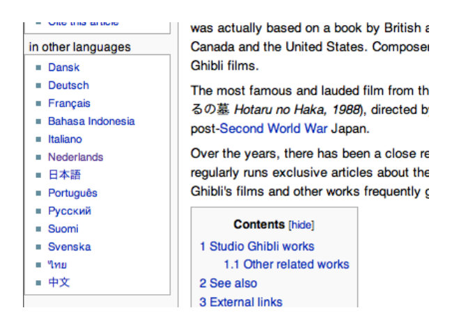
Figure 2: Links to pages devoted to the same topic in other languages.

concepts or entities that have entries in Wikipedia, and we will represent sentences by entries from this lexicon: an entry is used to represent the content of a sentence if the sentence contains a hypertext link to the Wikipedia page for that entry. Sentence similarity is then captured in terms of the shared lexicon entries they share. In other words, the similarity measure that we use in this approach is based on "concept" or "page title" overlap. Intuitively, this approach has the advantage of producing a brief but highly accurate representation of sentences, more accurate, we assume than the MT approach as the titles carry important semantic information; it will also be more accurate than the MT approach because the translations of the titles are done manually.