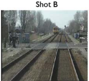
van der cursus voor leerlingen chinees eruit de keuzes meijer