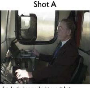
dan dertig jaar machinist vanuit het ministerie zijn er 20 citeerde scholen en bedreigingen van de moderne werkplaats in de lijn de grens van de spoorwegen de trein gerepareerd worden er er

Video is characterized by a temporal mismatch between the mention of an object in the speech channel and its occurrence in the visual channel. These two sources of information are not necessarily synchronized. An example is given in Figure 4. Dutch readers will notice that the quality of the speech transcriptions is not perfect. Nevertheless, the speech transcripts can still contain valuable clues for search. For example, imagine that we need to find stock shots of trains. The Dutch word for train, trein, has been recognized in the speech track of shot A. A train can be seen in the visual track of the next shot, shot B. So when we are looking for trains, the occurrence of the word trein indicates that we are likely to find a train in some of the shots that surround it. Moreover, the closer a shot is to the word, the more likely that shot is to contain a train. This property can be used to advantage when searching through large video databases with speech transcripts. By analysing the characteristics of displacement, we discovered systematic shifts between spoken words describing objects, and the visual occurrence of those objects (Huurnink and de Rijke 2007). We performed such an analysis on a corpus of news video, and found that objects tend to be seen in the shot after they are