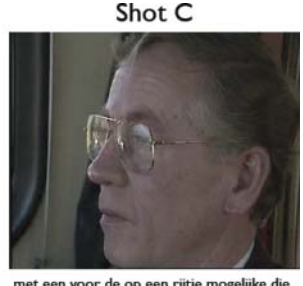
met een voor de op een rijtje mogelijke die zie je wel eens eerder ja je

FIGURE 4 An illustration of the temporal displacement between the mention of a train in the speech transcript, and its occurrence in video.