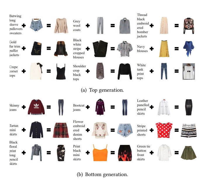
Figure 5: Case studies of generation. Each case is in the form: "given description + given item = generated item".

Although this paper focuses on improving recommendation by incorporating generation, we also list some generation cases in Figure 5. Overall, the generated items are able to match the given input. For example, in the sixth case of the top generation, the generated navy blouse with the yellow keen length skirt looks beautiful and elegant. Although there are many kinds of navy blouses