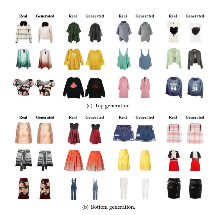
Figure 3: Comparison between real and generated images.

We list some recommendation produced by FARM in Figure 4. For each input, we list the top-10 recommended items. We highlight the positive items with red boxes. We can see that most recommended items not only match the given items, but also meet the given descriptions. For example, in the second case of the top recommendation, the given top description is "sleeve black blazer outerwear jackets," so most recommended tops are jackets, and especially almost all recommended tops are black. Also in the first case of the bottom recommendation, the given bottom description is