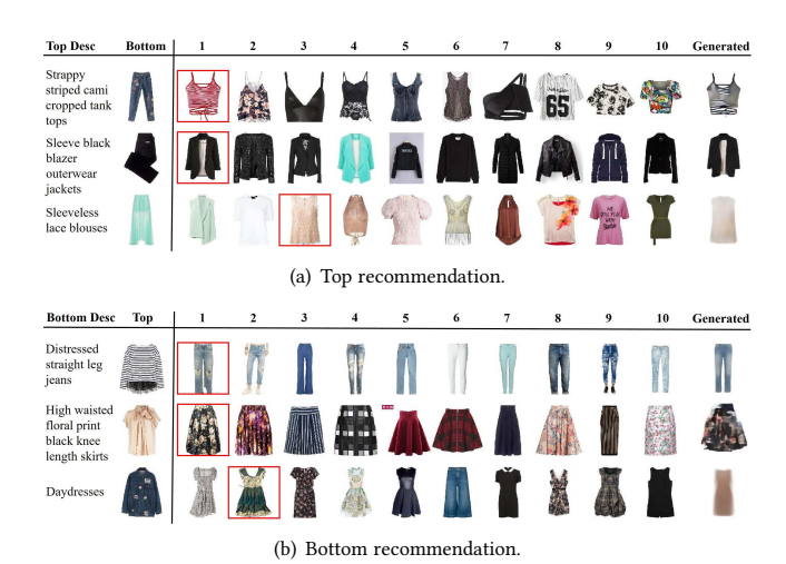
Figure 4: Case studies of recommendation. The items highlighted in the red boxes are the positive ones.

"distressed straight leg jean," so the recommended bottoms are all jeans, most of which are straight leg and some are distressed. By comparing the generated items with the recommended items, such as in the first case of the top recommendation and the second case of the bottom recommendation, we can see that the generated images are able to provide good guidance for the recommendation.