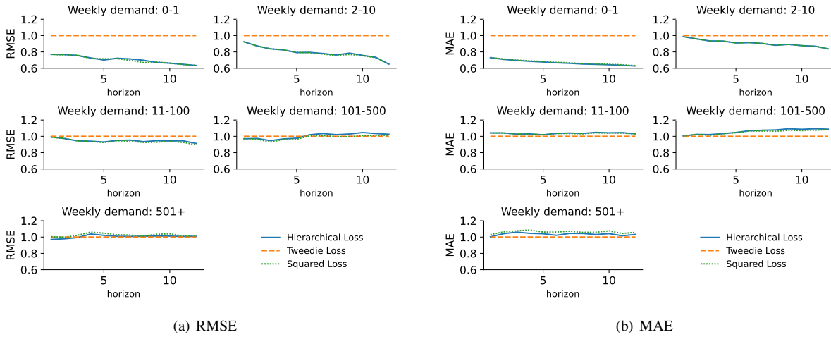
Figure 1: Forecasting results for the primary product forecasting model at our e-commerce partner bol. We show RMSE (a, left) and MAE (b, right) by weekly demand bucket relative to the Tweedie loss baseline for each forecasting horizon (week). The Hierarchical loss outperforms the Tweedie loss on RMSE and MAE on smaller weekly demand buckets.