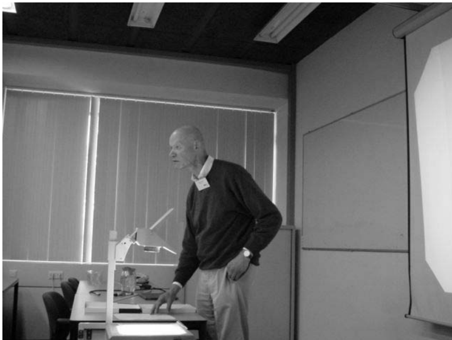
Lecturing at Lorentz Center, Leiden, 2004

For the second question Thomas introduced the notion of \Sigma -completeness. A Banach space E is \Sigma -complete if, for every sequence (x_n) with the property that \sum_{n=1}^{\infty} |\langle x_n, x' \rangle| < \infty for all x' \in E' , there exists x \in E such that \sum_{n=1}^{\infty} \langle x_n, x' \rangle = \langle x, x' \rangle for all x' \in E' . Then Thomas proved: If the Banach space E is \Sigma -complete then a scalar-integrable function f is integrable, and the weak integral of f agrees with the integral of f . The thesis, which contains a large number of other results, has