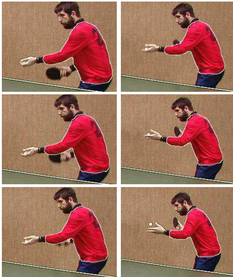
Fig. 5. Frames from a video showing a man against a textured background playing ping-pong. From top-down and left-right frames are showing by tracking the body of the person.

Region Growing, and Bayes/MDL for Multiband Image Segmentation, PAMI(18), No. 9, September 1996, pp. 884-900.