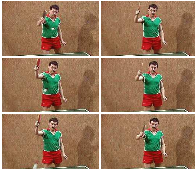
Fig. 4. Frames from a video showing a person against a textured background playing ping-pong. From top-down and left-right frames are showing by tracking the T-shirt of the person.