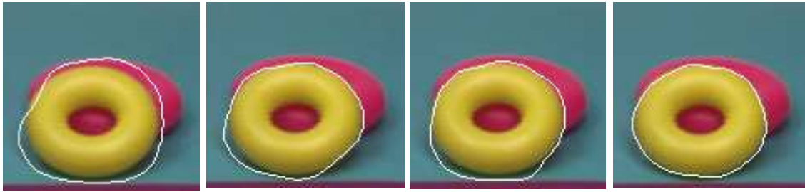
Fig. 3. From left to right a. Colour image with the initial contour as specified by the user (the white contour). b. Segmentation result based on intensity gradient field \nabla I . c. Segmentation result based on RGB gradient field \nabla C_{RGB} . d. Segmentation result based on \theta_1\theta_2 gradient field \nabla C_{\theta_1\theta_2} .